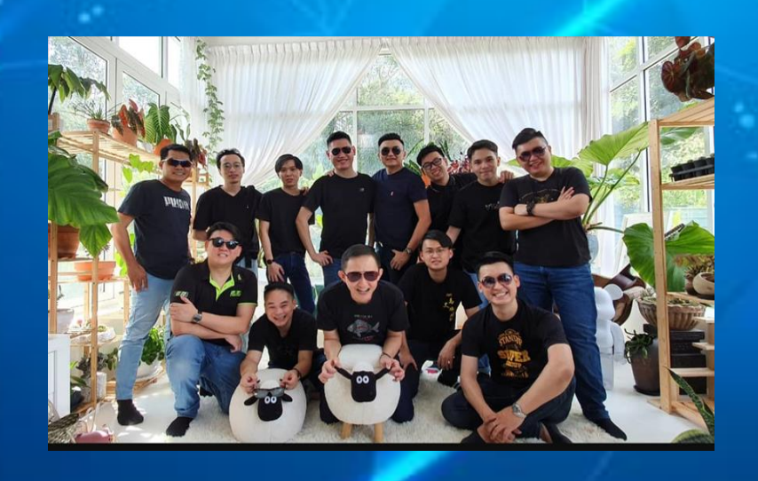
Casual Theme for 2021 AVA Planners (GELM)

Formal Theme for 2021 AVA Planners (GELM) and (GETB)