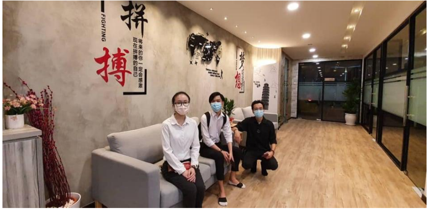
SG Agency office (Johor)