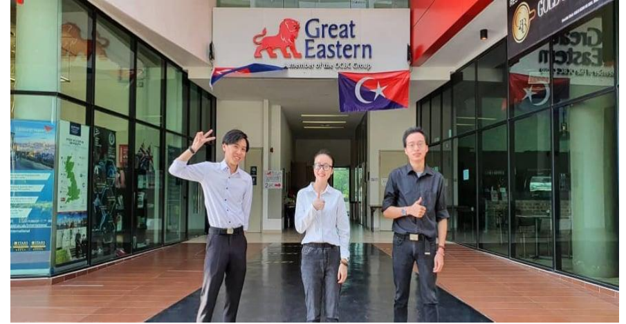
Great Eastern office (JB Branch)