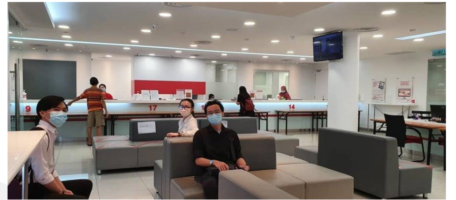
Great Eastern office (JB Branch)