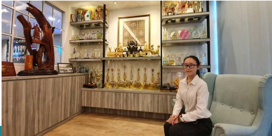
SG Agency office (Johor)