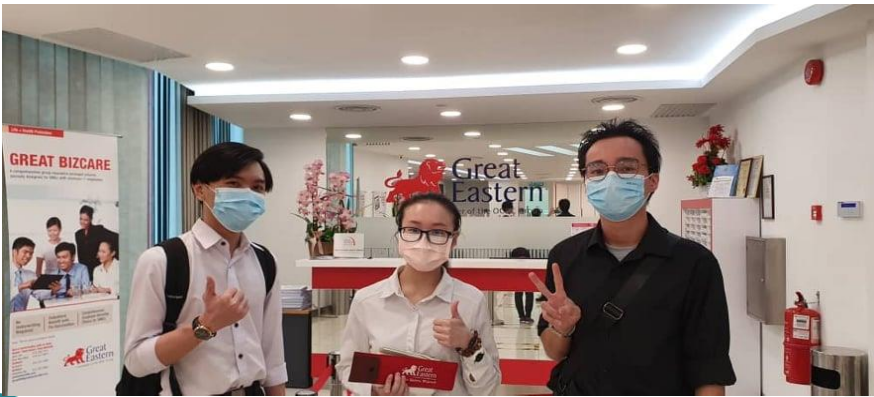
Great Eastern office (JB Branch)