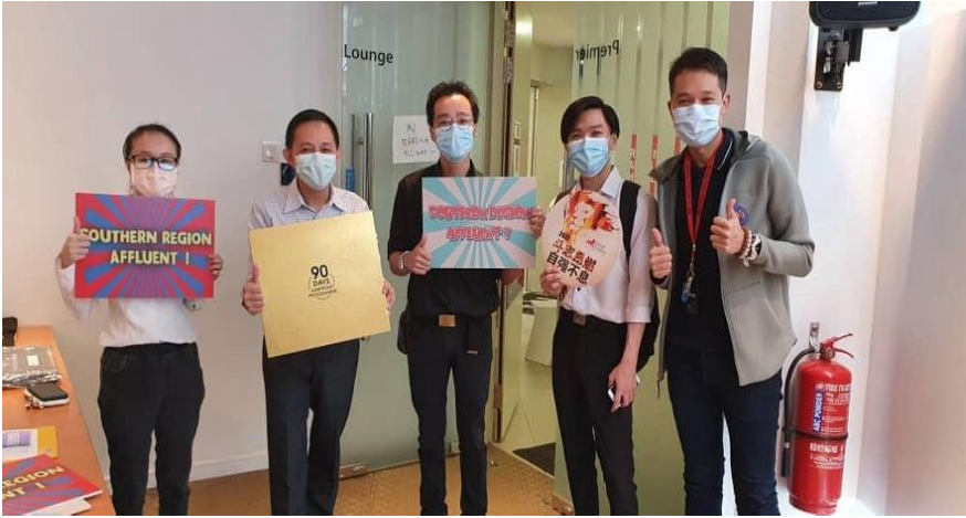
Great Eastern office (JB Branch)