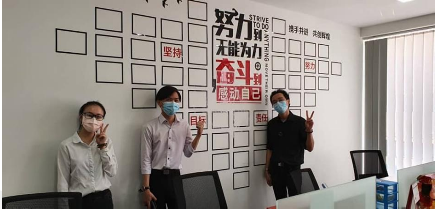
SG Agency office (Johor)